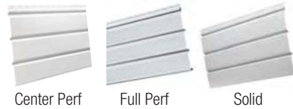
Center Perf Full Perf Solid