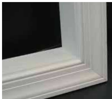
2-1/4" Beaded Colonial - Picture Framed