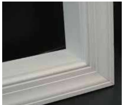
2-1/4" Beaded Colonial - Picture Framed