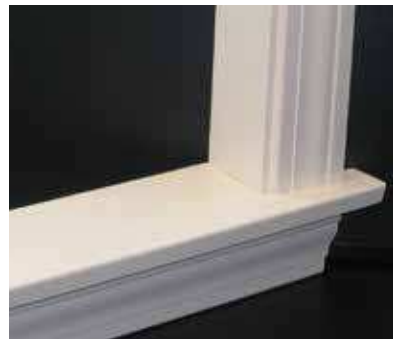
2-1/2" Colonial with Stool & Apron