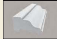
Rake WM287 Item #519275753 12' length