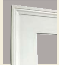
1x4 with Backband