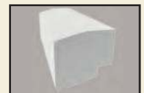
Historic Sill Nose 2" Item #519275990 16' length