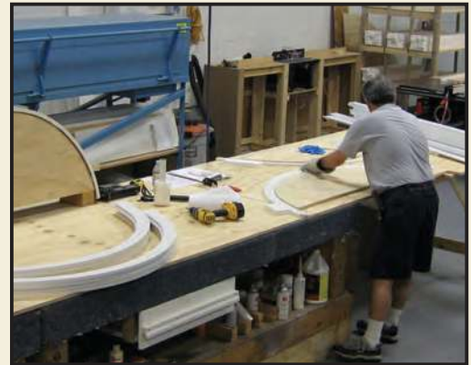
Our Nashua, NH Millwork Shop