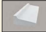
Drip Cap WM197 Item #519275760 12' length