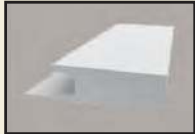
5/4 x 4 J-Channel Casing Item #519275734 12' length Item #519275954 16' length