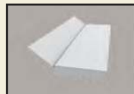
ThermoStop 7': Item #519275767 9': Item #519275769