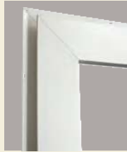
5/4 x 4 with J