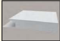
5/4 x 6 J-Channel Casing Item #519275736 12' length