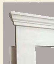
5/4 x 4 with Ram's Crown