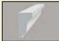
Pediment Item #519275750 12' length