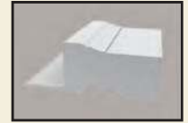
Brickmould w/nail fin WM180F Item #519275710 12' length