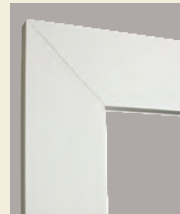
5/4 x 4 Flat