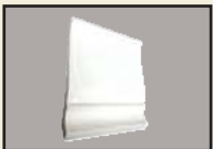
7-1/2" Crown Item #200055667 16' length