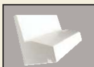
Water Table Item #200055669 16' length