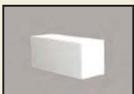
A/C Sill Adaptor Item #519275701 1-1/2" x 1-1/4" x 42" cut to size in the field