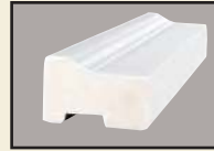
Brickmould WM180 Item #519275808 18' length