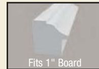
Backband WM6931 Item #519275755 12' length