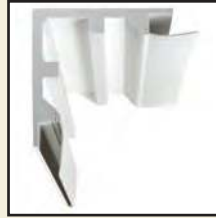
5-1/2" Siding Corner - Smooth w/J Item #200004831 5-1/2" sq. x 20'