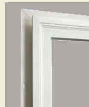
Brickmould (908) with J