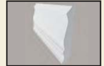
3-5/8" Crown WM49 Item #519275741 12' length