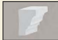
Ram's Crown WM6934 Item #519275742 12' length