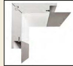
Shown with nail fin and optional routed edge