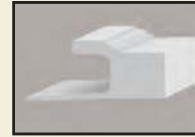
J-Channel Brickmould WM180JF Item #519275711 7' length