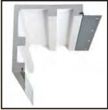
5-1/2" Siding Corner - Smooth w/Nail Fin Item #519275768 5-1/2" sq. x 19-1/2'