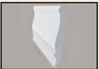
4-5/8" Crown WM47 Item #519275740 12' length