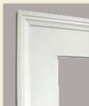
1x6 with Backband