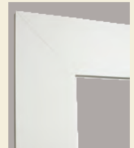
5/4 x 6 Flat