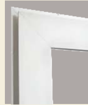
5/4 x 6 with J