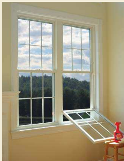
Tilt-in top and bottom sash for easy cleaning.